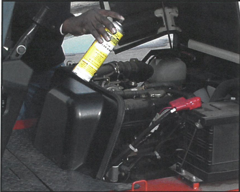
RELIEVES FRICTION BIND—FAST

SPECIALTIES FOR MAINTENANCE AND SANITATION SINCE 1947