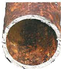
1351-ES stops corrosion in Boiler Tubes.

DESIGNED for use in low to medium pressure boilers when the steam does not contact food or food processing equipment. Condensate line protection is also provided with the use of Foremost 1351-ES Boiler Treatment.