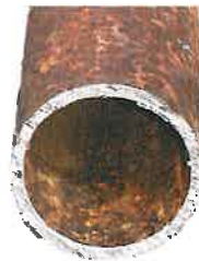
TOWER TREET STOPS corrosion and scale in towers and piping. 1/8 inch of scale thickness causes 10% energy loss!

NON-POLLUTING —Environmentally acceptable, biodegradable. Contains no chromates, zinc, or other polluting metals.