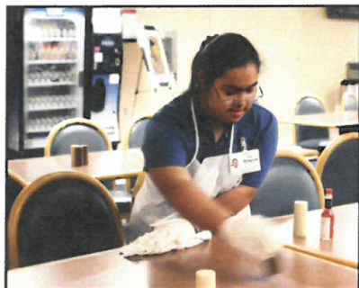
SPRAY & WIPE

SPRAY - WIPE - AIR DRY OR SIMPLY WET SURFACE & AIR DRY