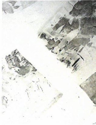
Quickly Dissolves And Removes Tire Burns From Traffic Areas.