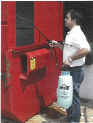
Ideal For Deodorizing And Degreasing Dumpsters.