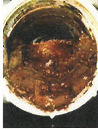
Liquefies Grease Solids For Improved Flow