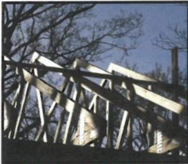
CLEANING BUILDING TRUSSES

Controls Odors by Eliminating the Source