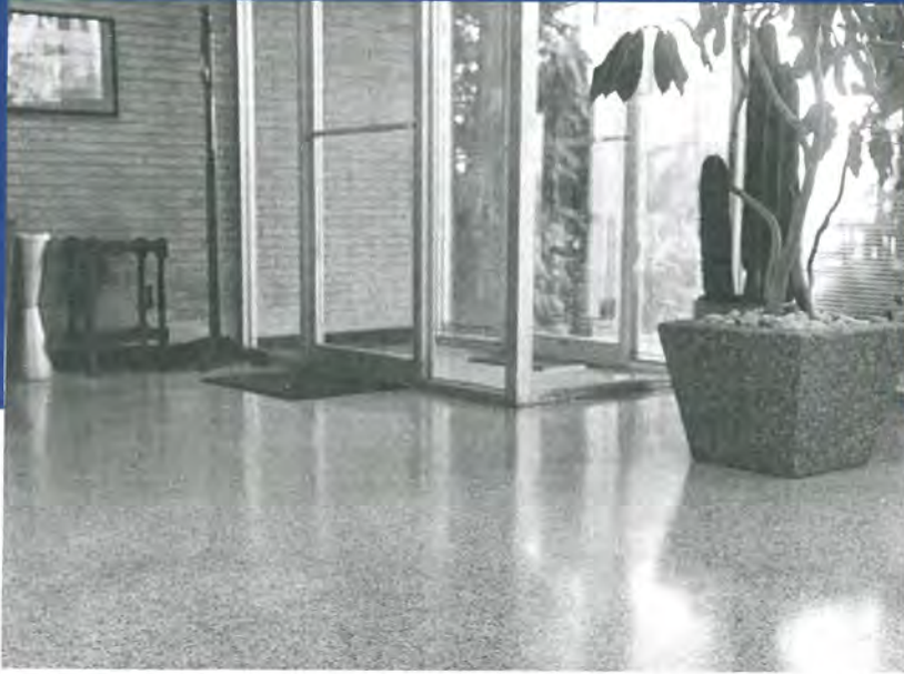
Foremost Dust-A-Way ... for clean and dust free Offices and Stores.