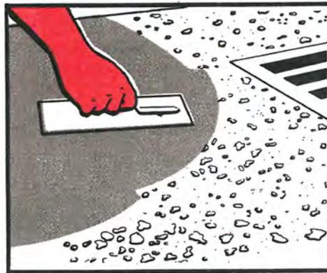
RESURFACES SPALLED OR ERODED SURFACES