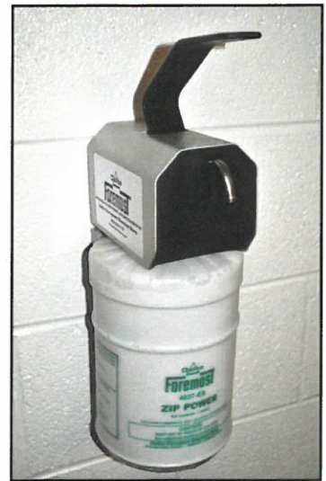
The FM 9582 Master Wall Mount Dispenser provides a convenient way to dispense Zip Power in shops and service areas.