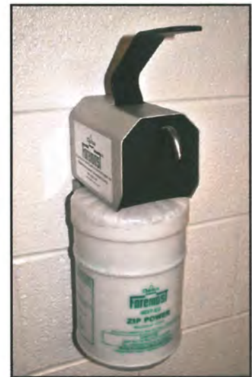
The FM 9582 Master Wall Mount Dispenser provides a convenient way to dispense Zip Power in shops and service areas.