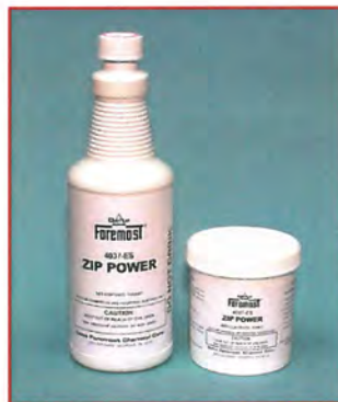
Zip Power in handy flip-top quarts and wide-top pints - ideal for mobile service technicians.