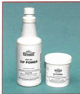
Zip Power in handy flip-top quarts and wide-top pints - ideal for mobile service technicians.