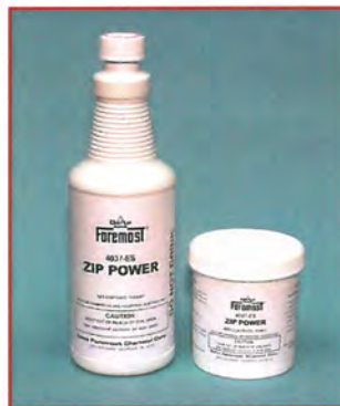
Zip Power in handy flip-top quarts and wide-top pints - ideal for mobile service technicians.