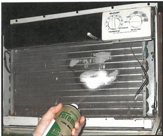
UNIQUE DIRECTIONAL DISPENSING

SPECIALTIES FOR MAINTENANCE AND SANITATION SINCE 1947