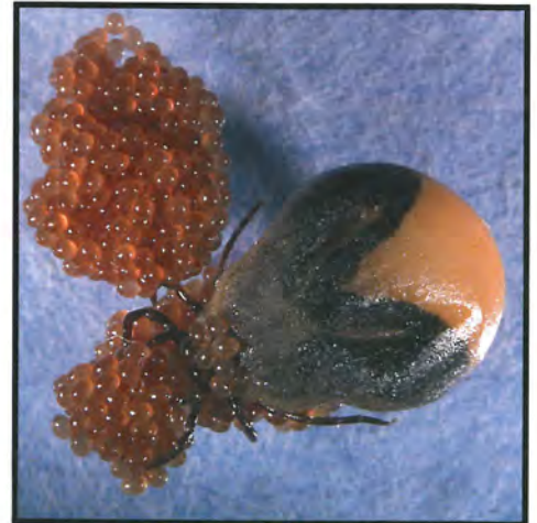
FLEAS & TICKS