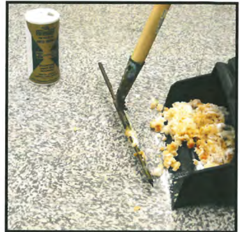
REMOVE TO CLEAR RESIDUE

FAST —Designed to quickly absorb and deodorize water-based spills.