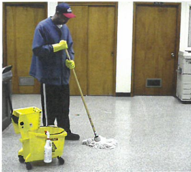
Mop or Brush