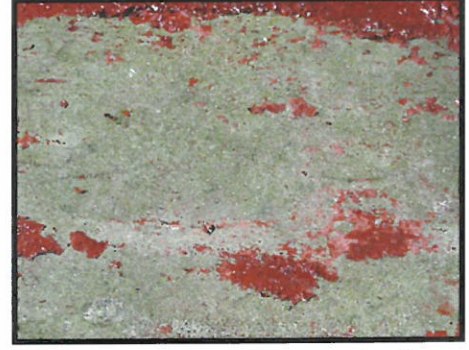
Scrape or Pressure Rinse Surface

VERSATILE —Safely strips most paints, adhesives, inks, and resins.