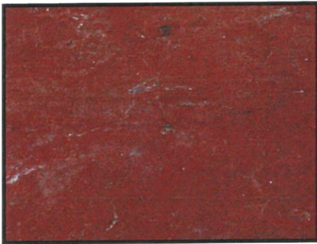
Apply to Surface