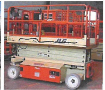
Ideal for cranes, cherry pickers, scissor lifts.

IMPERVIOUS to rain, snow, sun or any other weather conditions when used according to directions. Blocks out paint overspray and solvents. Outdoor Mask-A-Way stays on until you remove it with FM 1056-ES Mask Off or a similar product and pressure washer rinse.