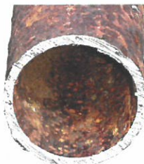
1351-ES stops corrosion in Boiler Tubes.

DESIGNED for use in low to medium pressure boilers when the steam does not contact food or food processing equipment. Condensate line protection is also provided with the use of Foremost 1351-ES Boiler Treatment.