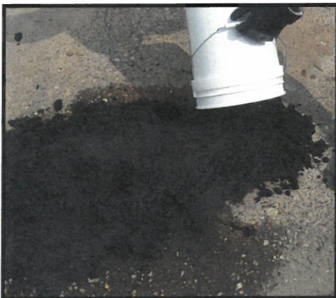
POUR — 10:10 AM