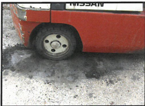
TRAFFIC — 11:10AM*