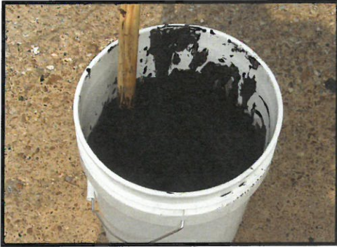
MIX — 10:00 AM

SPECIALTIES FOR MAINTENANCE AND SANITATION SINCE 1947